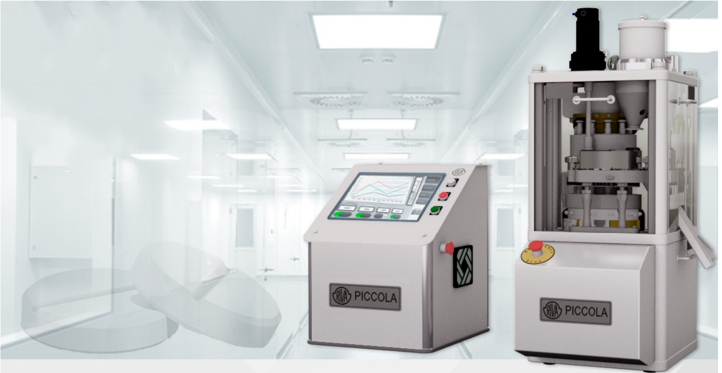
Table rotary tablet press with control module.

The PICCOLA CLASSICA is a rotary tablet press intended for the Research & Development area, designed for pilot plants and/or small production batches. Its settings allow operating with one to ten sets of punches placed in the turret head.