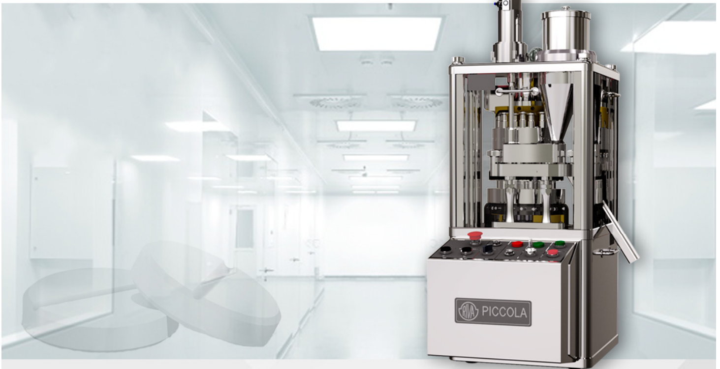
Table rotary tablet press ideal for research and development

The PICCOLA CLASSICA is a rotary tablet press intended for implementation in the research and development area, and it is designed for pilot plants and/or small production batches. Its settings allow operating with one to ten sets of punches placed in the turret head. Punches and dies conform to the international TSM or EU (B/D) standards.